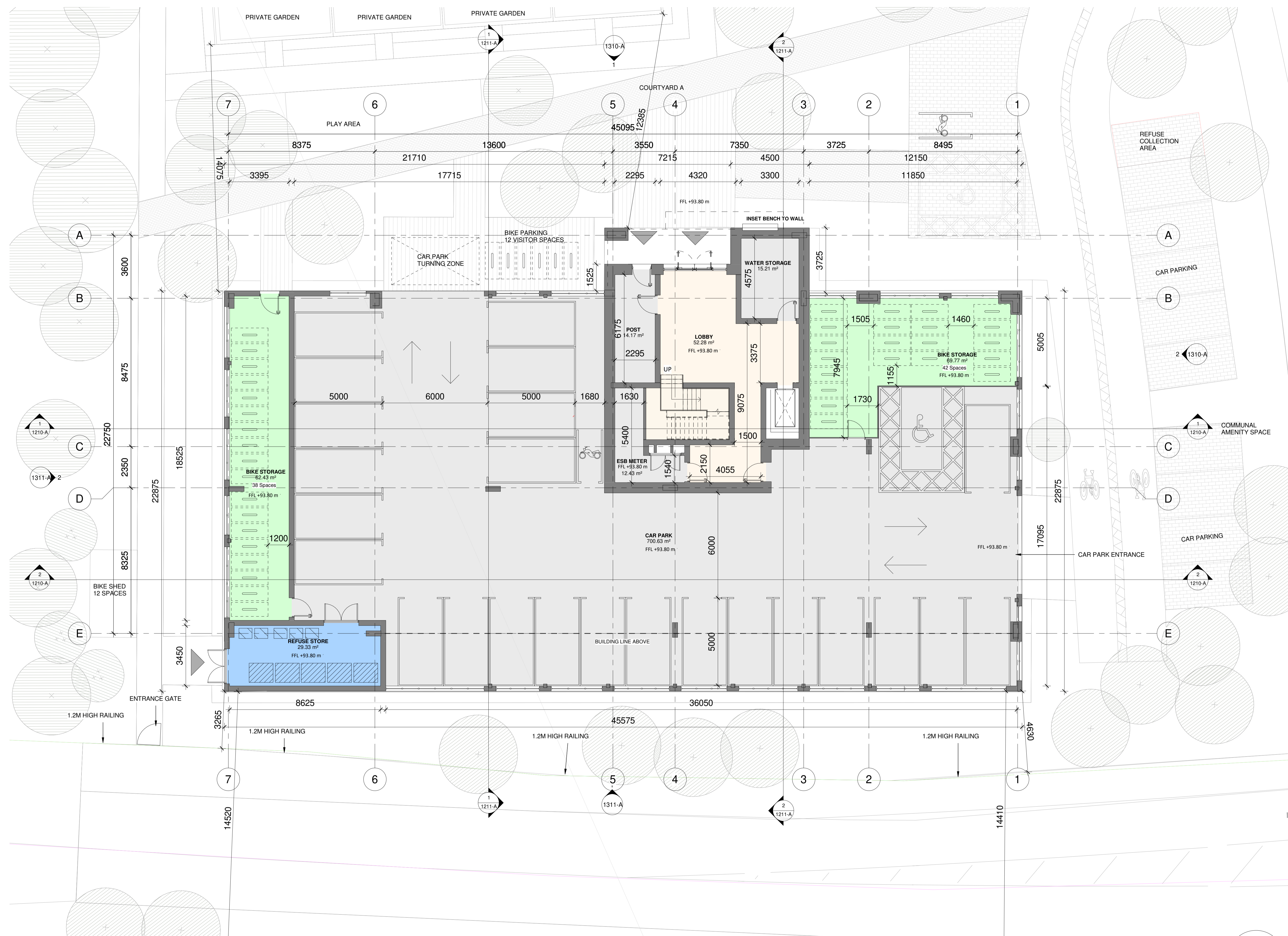
1 Ground Floor Plan A - GA 1:100