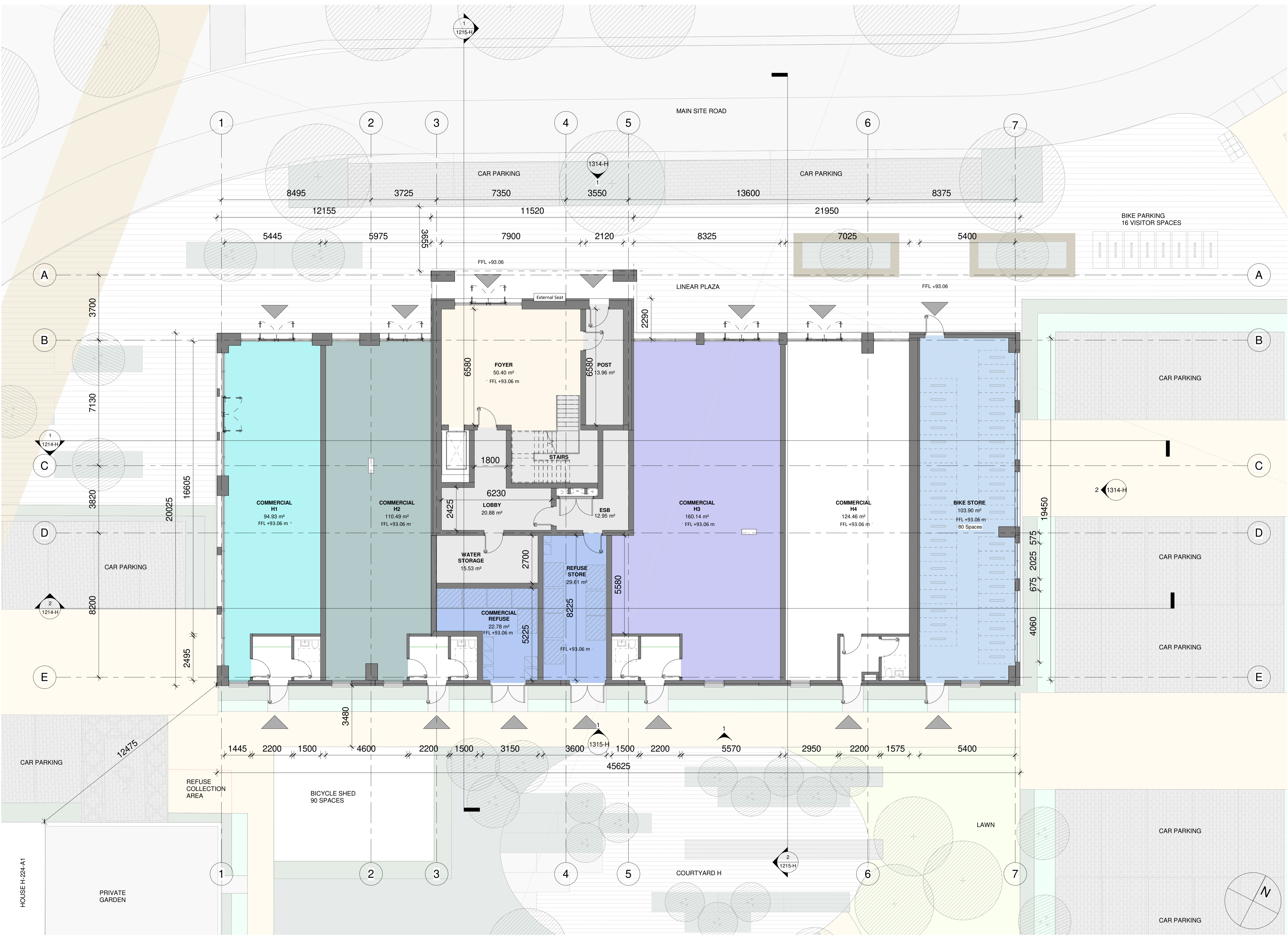
1 Ground Floor Plan - GA 1 : 100