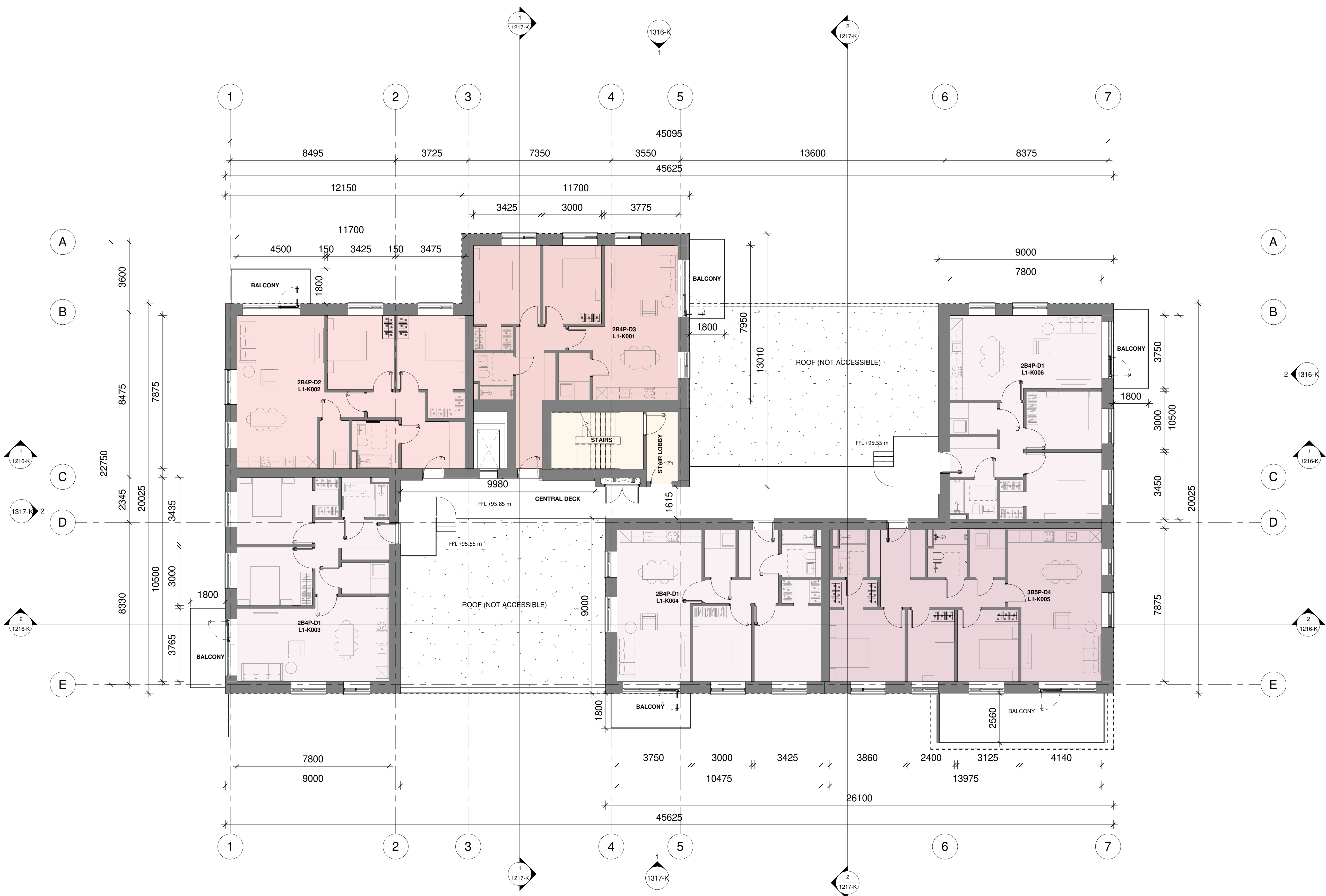
1 First Floor Plan - GA 1 : 100