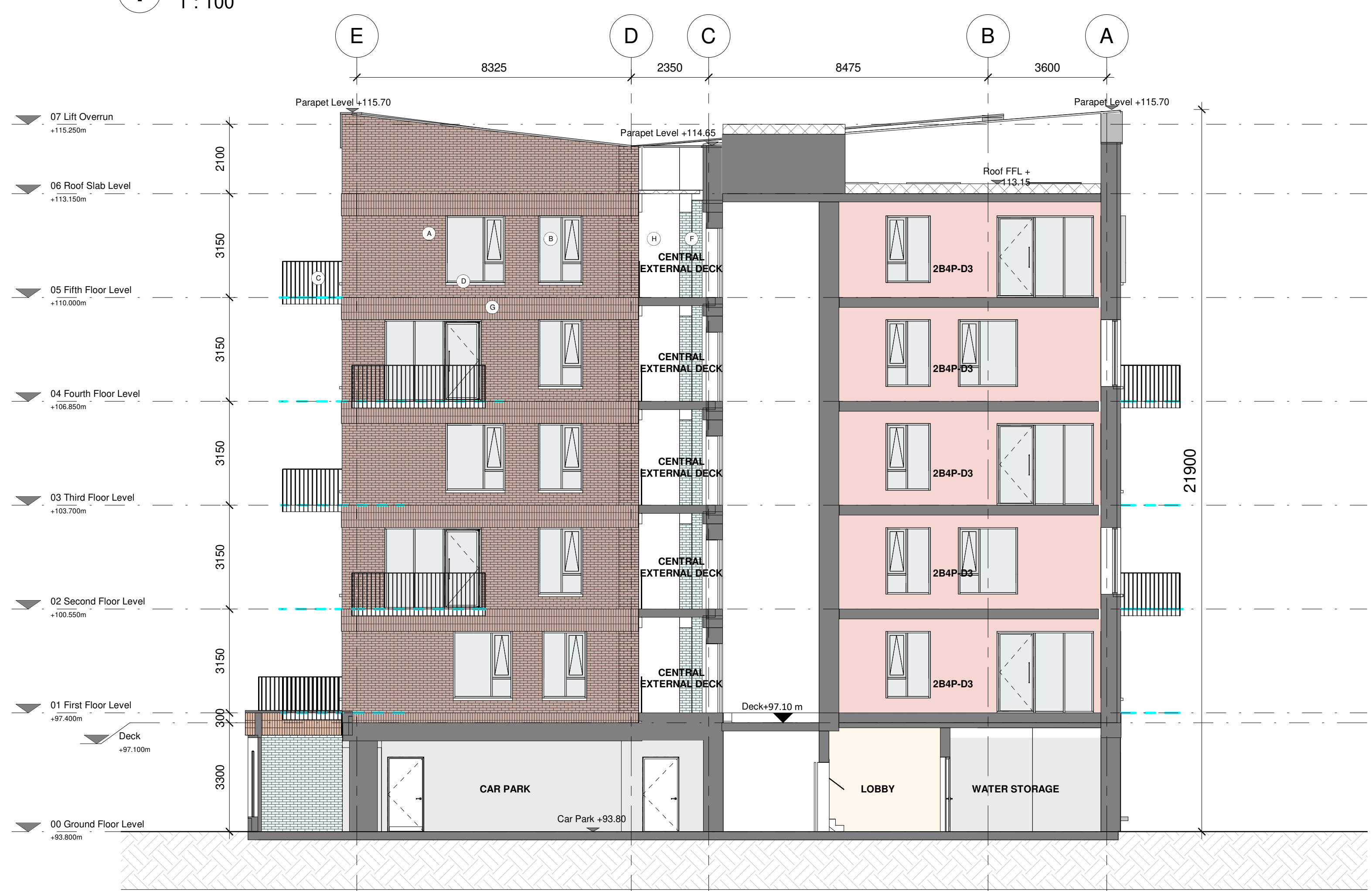
2 Section D-D 1 : 100