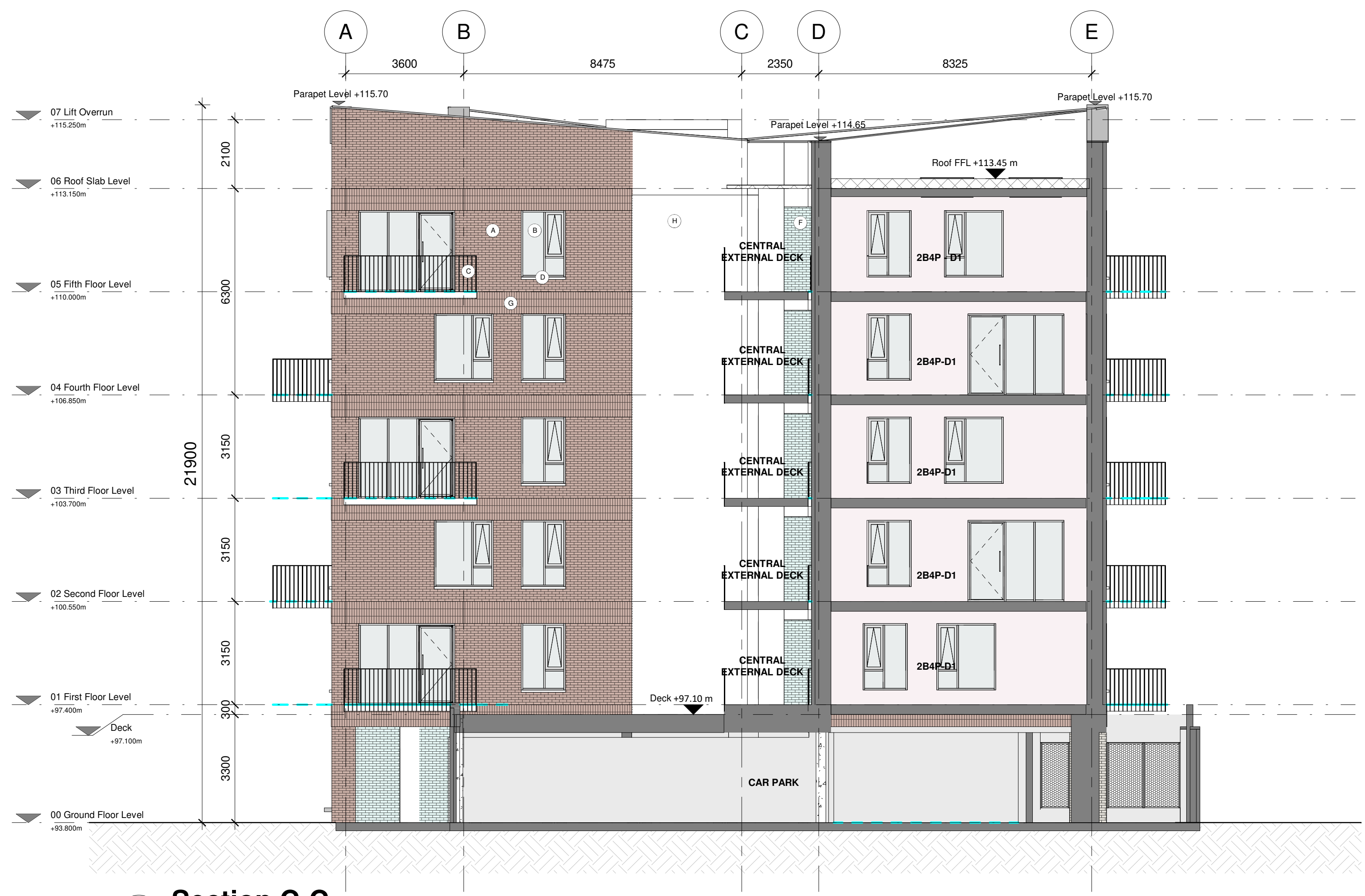
1 Section C-C 1 : 100